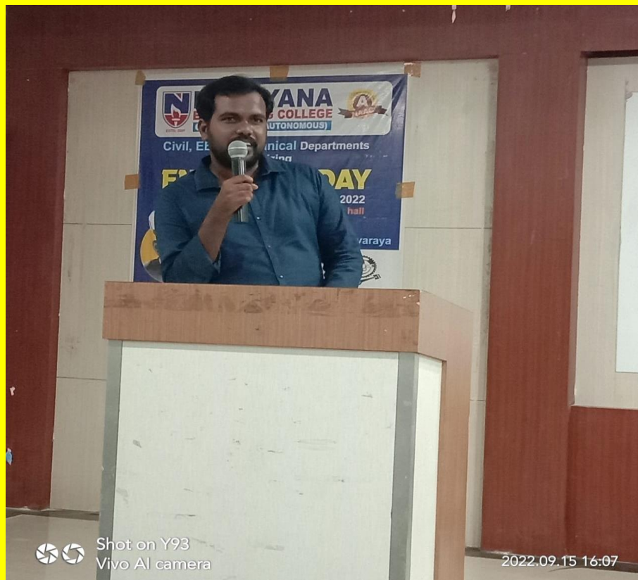
Chief guest Speech