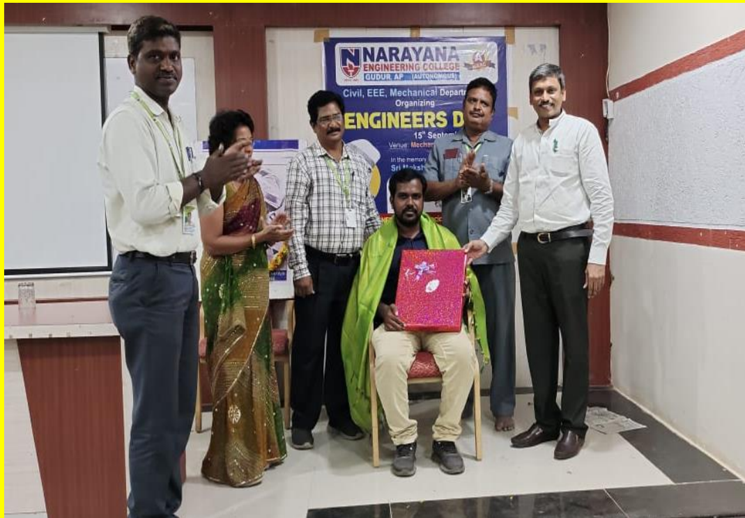
Honoring the Chief guest