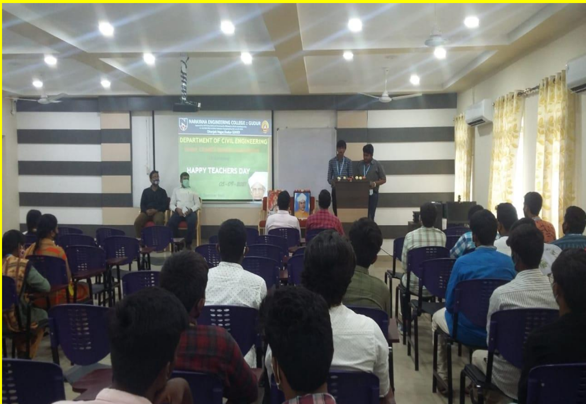
Students attended during event