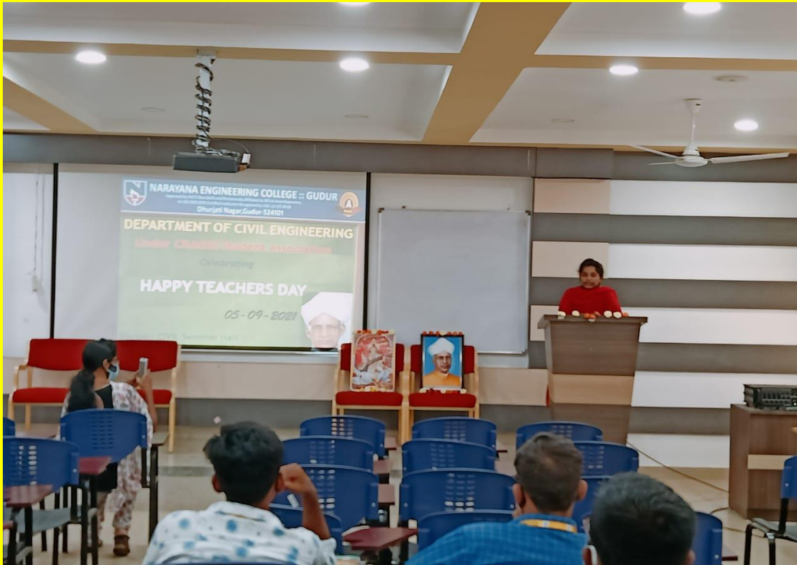
Student giving speech and expressing her gratitude